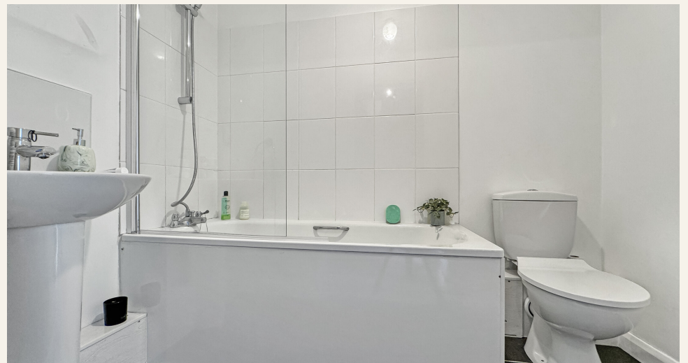
LIVING/DINING ROOM · KITCHEN · BEDROOM · BATHROOM