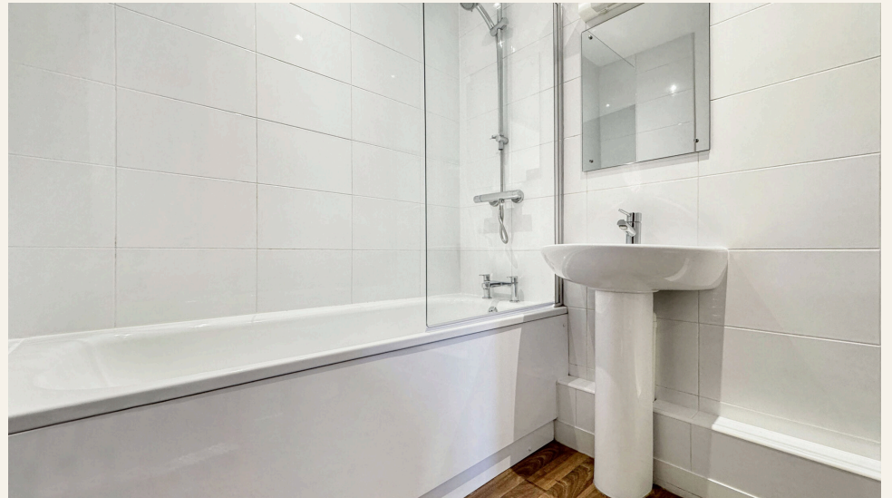
KITCHEN · FRONT ASPECT · BEDROOM · BATHROOM